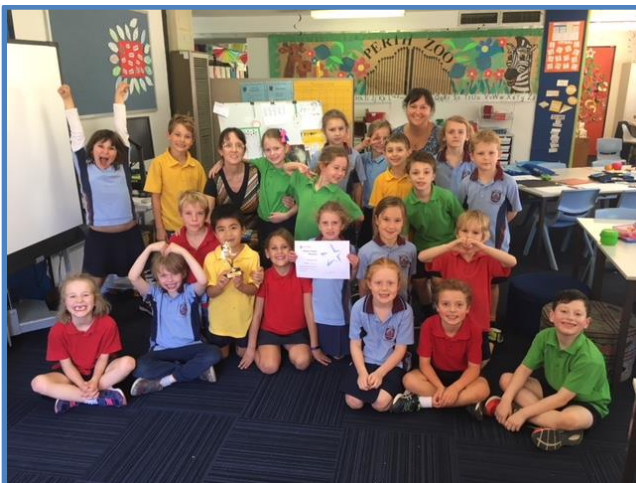
Week 6 Maths Factor winners Room 4 and a very excited Room 18.