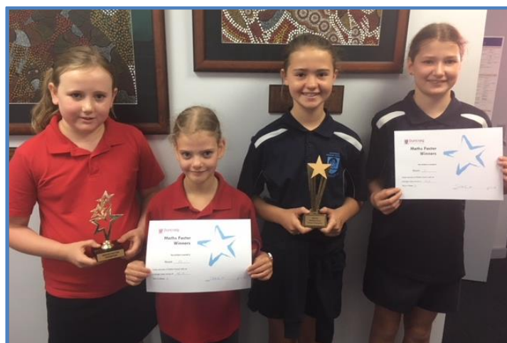
Week 5 Maths Factor Winners Room 13 and Room 1

If you have helped out at the school in any way in 2018 we would like to say thank you for your support. Please join us for morning tea in the Library on Thursday 6 December at 9am.