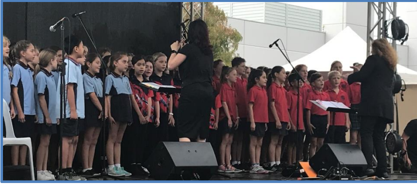
Duncraig Primary School choir performing at the Kaleidoscope festival in Joondalup.