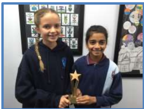
Week six -Room 1