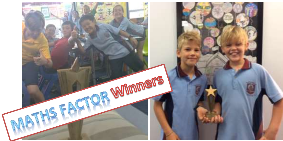
Week 5 Room 1